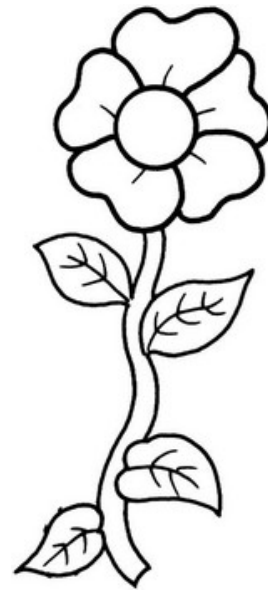
Color the picture.